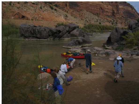
Black Rocks on Loma Run, Colorado River