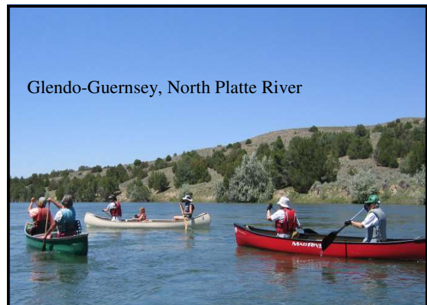
Glendo-Guernsey, North Platte River