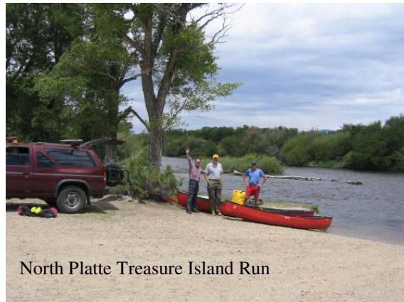
North Platte Treasure Island Run

One more item. When you are done paddling at a Poudre Paddler event, take a moment to thank the host. They are volunteers and make these trips possible.